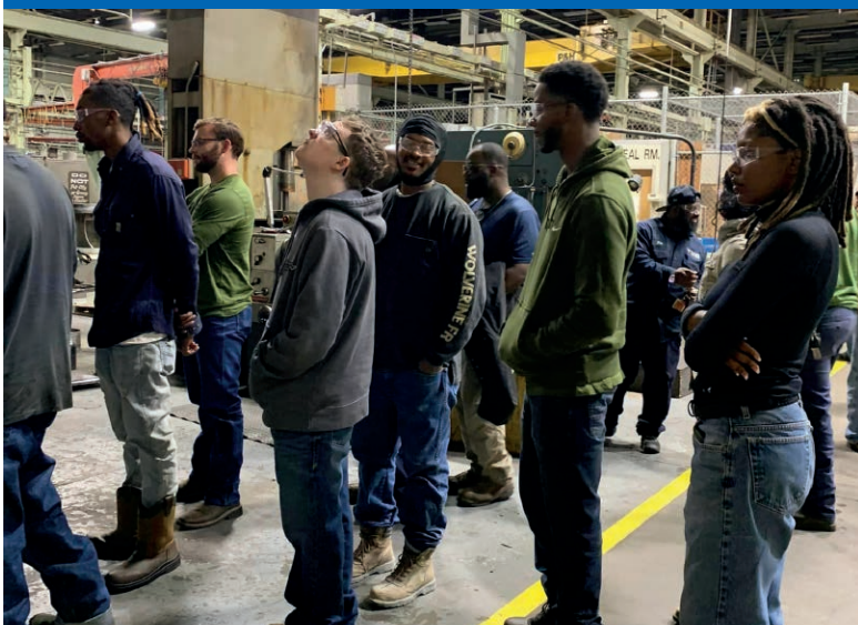
North Baton Rouge Industrial Training Initiative (NBRIT) cohort 9 students recently toured our facilities to learn more about operations, collaboration and potential career opportunities. NBRIT is an initiative among industry, contractor firms and Baton Rouge Community College to assist the North Baton Rouge community in acquiring the skills needed to compete for industrial jobs.