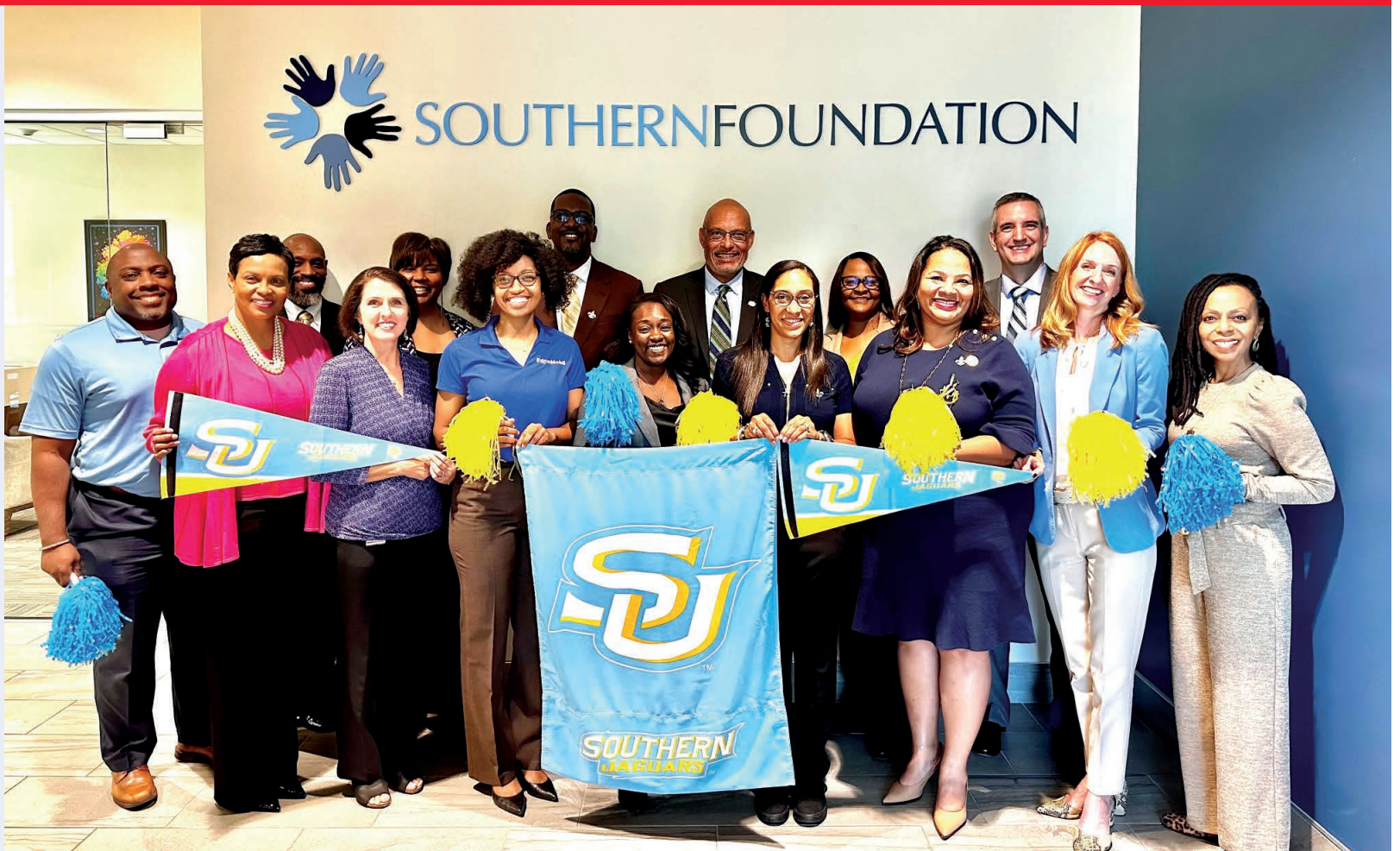
Southern University is a critical source of employee talent, expertise and community leadership in Baton Rouge. We celebrated our $200,000 investment in the university, which will support the Jaguar Success program for student retention, the Engineering Summer Science Institute Camp and various capacity-building grants.