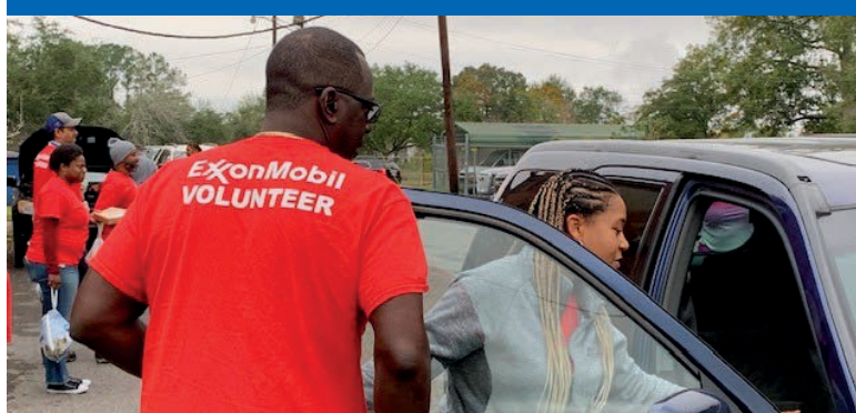
Our Black Employee Success Team put the "happy" in Happy Thanksgiving for several neighbors! The team donated 60 turkeys, pies and more for its annual Thanksgiving donation at Allen Chapel AME Church.