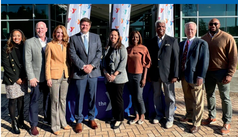
This October, YMCA of the Capital Area celebrated ExxonMobil's support of its summer enrichment program. The ExxonMobil YMCA saw a 57 percent increase in summer camp participation compared to last year.

Quality summer programs can help prevent learning loss and improve academic outcomes for children, especially those from families with financial barriers. Grant support from ExxonMobil Baton Rouge helped provide scholarships to make summer programs more accessible to all children.