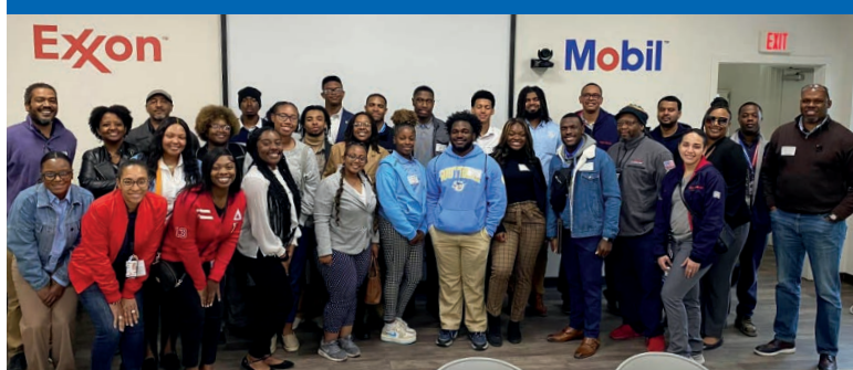
We hosted 21 STEM students from Southern University's Timbuktu Academy, a research-based mentoring program, for a tour of our machine shop and lab. Students also participated in a workshop featuring a panel of employees from different STEM backgrounds.