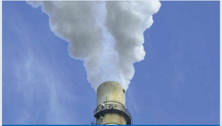
The largest plume rises above the wet gas scrubber, an environmental control device where water is utilized to reduce emissions