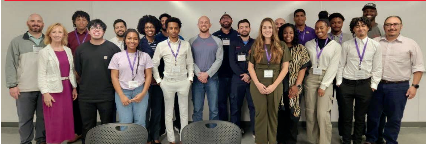
This year's ExxonMobil LSU Diversity Scholars program recently kicked off with 15 LSU engineering scholars, including five freshmen. For 20 years, this program has paired nearly 100 scholars with employee mentors.