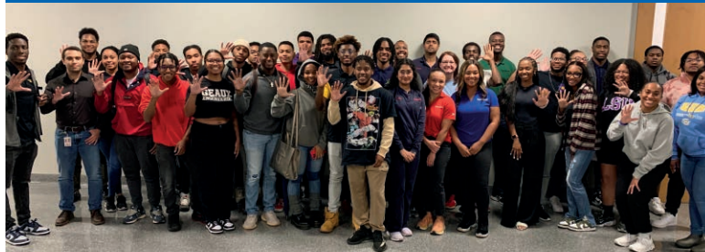
Nearly 50 students from LSU, Southern and the University of Louisiana at Lafayette received interview preparation and industry insight from employees at the National Society of Black Engineers Fall Regional Conference.