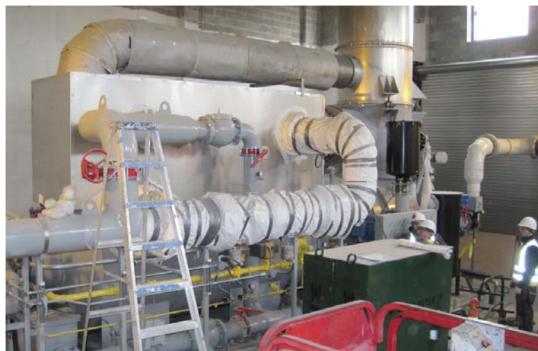
Engineers and contractors installed and finalized some of the connections of the Flame oxidizer unit—the principal treatment for the soil vapor extraction system.