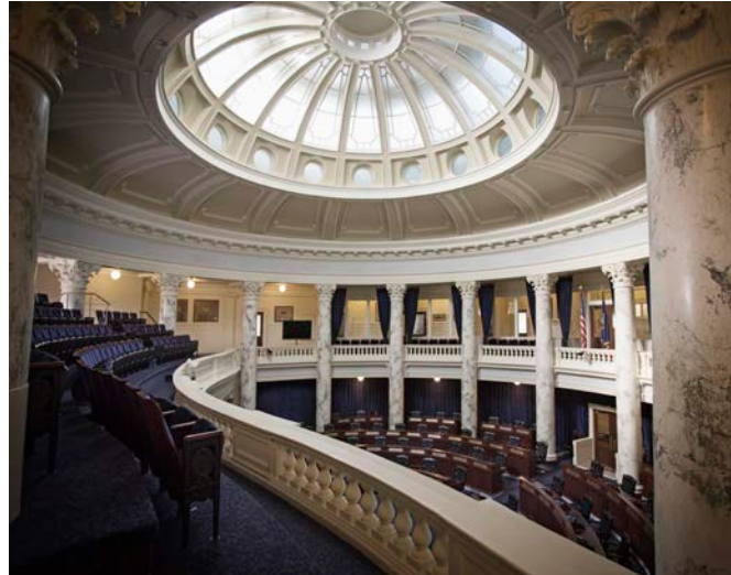
We support organizations that provide and promote sound policies and cross-cultural engagement.

ExxonMobil provides support to organizations that promote international relationships, institutions with strong research capabilities that contribute to informed policy decision-making, and organizations that assess public policy alternatives on issues of importance to the petroleum and petrochemical industries. In 2018, contributions for public information and policy research totaled more than $4.3 million, of which $4.2 million was within the United States.