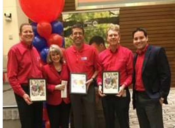
ExxonMobil employees in Houston celebrating a successful 2018 United Way campaign.

In addition, more than 15,000 employees volunteered approximately 443,000 hours to charitable organizations in 2018.