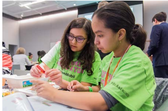
Participants at the ExxonMobil Introduce a Girl to Engineering Program in Dallas, Texas.

Outside the United States, we establish local partnerships with organizations that have close ties with a country's educational system. For example, we are helping to build primary schools in Angola through our work with the Qatar-based Educate A Child initiative and in partnership with the nonprofit RISE International.