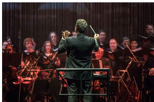
ExxonMobil donated more than $2.3 million to arts and cultural organizations in 2018.

In the United States, funding for the arts is provided primarily through the ExxonMobil Foundation's matching gift programs. In 2018, employees and retirees donated more than $2.1 million to arts and cultural organizations, and the ExxonMobil Foundation contributed more than $1.6 million by matching their donations.