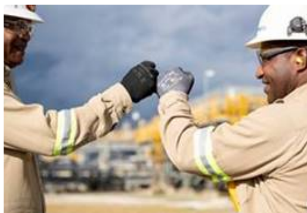
ExxonMobil supports workforce development programs to help recruit, train and develop workers for successful careers.

In the United States, ExxonMobil funded workforce development programs to recruit, train and develop workers for successful careers with local industrial employers. In the Houston area, for example, we provided $100,000 to the Lee College Community College Petrochemical Initiative. In Baton Rouge, we supported the North Baton Rouge Industrial Training Program at the Baton Rouge Community College.