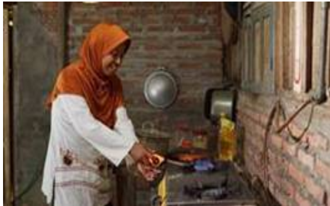
ExxonMobil supports programs to help women fulfill their economic potential and improve their well-being.

In 2018, contributions totaling $6.2 million were made to help advance economic opportunities for women. Empowering women is a key element in enhancing local and international economic development. Investing in women helps support broad transformation in developing regions and contributes to a more equitable society. For example, it helps to lower infant mortality, improve health and nutrition, increase educational opportunities, enhance economic growth and food security, and reduce poverty.