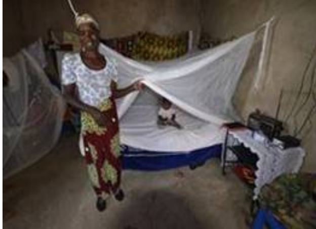
ExxonMobil has helped distribute more than 15 million bed nets since 2000.

In 2018, ExxonMobil's health and environmental contributions totaled $18.5 million, with $12.4 million benefiting communities outside of the United States. Our environmental investments focus on several important areas including conservation in a range of ecosystems, environmental education and outreach, and scientific research of environmental issues. These contributions are only a small portion of our company's overall investments in the environmental area; investments do not include the company's environmental capital and operating expenditures.