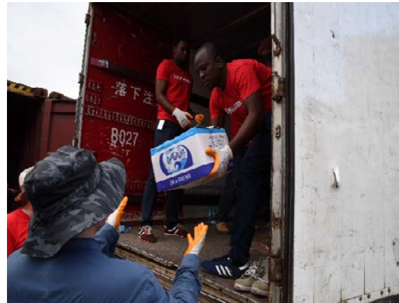
ExxonMobil Mozambique employees assisting in relief efforts following Cyclone Idai.

In 2018, more than 15,000 ExxonMobil employees, retirees, and their families donated approximately 443,000 volunteer hours to more than 3,500 charitable organizations in 33 countries through company-sponsored volunteer programs. Of this total, more than 6,000 people volunteered more than 45,000 hours with 433 organizations in countries outside the United States.