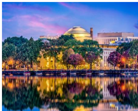
ExxonMobil granted $41 million to colleges, universities and other higher education organizations in 2018.

Our major financial support for higher education in the United States is through the ExxonMobil Foundation's Educational Matching Gift Program. In 2018, we granted almost $32.9 million in matching funds to 833 colleges and universities, the United Negro College Fund, the Hispanic Scholarship Fund and the American Indian College Fund.