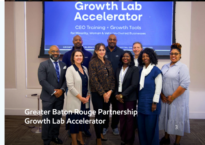
Greater Baton Rouge Partnership Growth Lab Accelerator

ExxonMobil Baton Rouge supports supplier diversification through two key programs: the LCA Reverse Trade Show and the Growth Lab Accelerator.