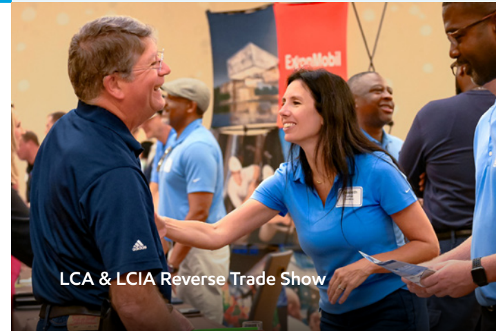
LCA & LCIA Reverse Trade Show

The Greater Baton Rouge Economic Partnership Growth Lab Accelerator is a high-value, fast-paced accelerator designed for entrepreneurs, small-business owners, and emerging leaders. The program delivers practical leadership, team management and business-growth tools that can be put to work immediately.