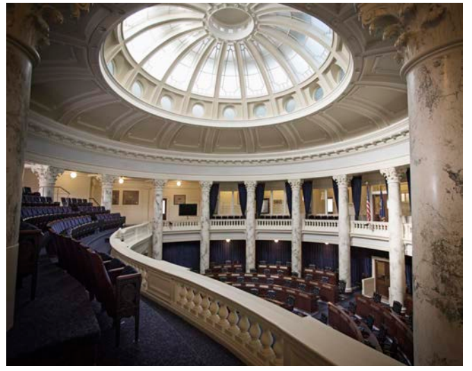
We support organizations that provide and promote sound policies and cross-cultural engagement.

We support organizations that foster international understanding and engagement, including the Council on Foreign Relations and the World Affairs Council. Our involvement with the Business Council for International Understanding, Corporate Council on Africa and similar organizations facilitates crosscultural awareness and progress.