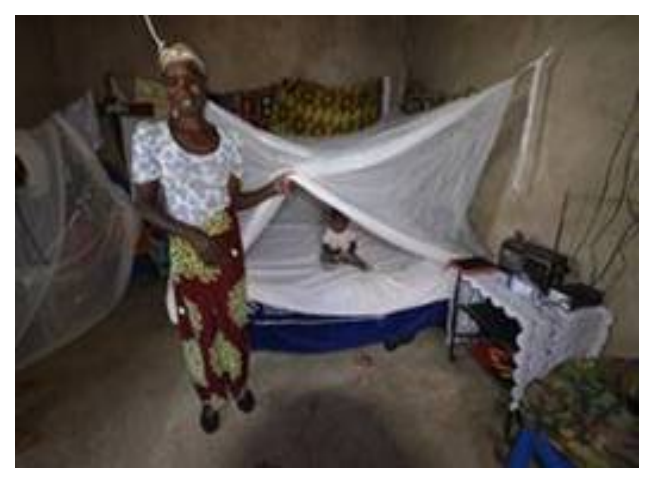
ExxonMobil has helped distribute more than 15 million bed nets since 2000.

In 2018, ExxonMobil's health and environmental contributions totaled $18.5 million, with $12.4 million benefiting communities outside of the United States. Our environmental investments focus on several important areas including conservation in a range of ecosystems, environmental education and outreach, and scientific research of environmental issues. These contributions are only a small portion of our company's overall investments in the environmental area; investments do not include the company's environmental capital and operating expenditures.