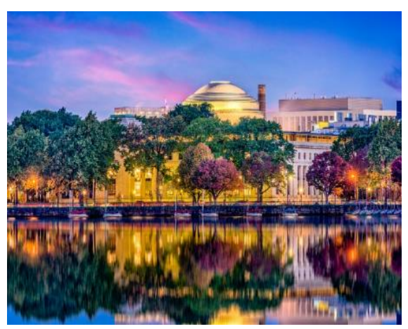
ExxonMobil granted $41 million to colleges, universities and other higher education organizations in 2018.

Our major financial support for higher education in the United States is through the ExxonMobil Foundation's Educational Matching Gift Program. In 2018, we granted almost $32.9 million in matching funds to 833 colleges and universities, the United Negro College Fund, the Hispanic Scholarship Fund and the American Indian College Fund.