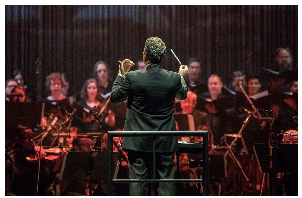
ExxonMobil donated more than $2.3 million to arts and cultural organizations in 2018.

In the United States, funding for the arts is provided primarily through the ExxonMobil Foundation's matching gift programs. In 2018, employees and retirees donated more than $2.1 million to arts and cultural organizations, and the ExxonMobil Foundation contributed more than $1.6 million by matching their donations.