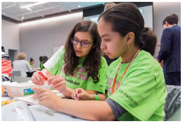
Participants at the ExxonMobil Introduce a Girl to Engineering Program in Dallas, Texas.

Outside the United States, we establish local partnerships with organizations that have close ties with a country's educational system. For example, we are helping to build primary schools in Angola through our work with the Qatar-based Educate A Child initiative and in partnership with the nonprofit RISE International.