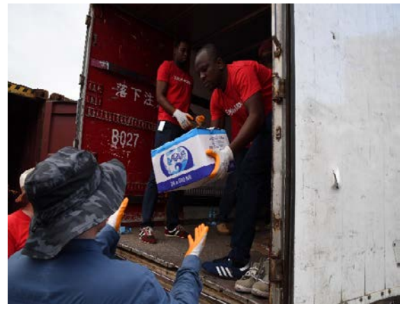
ExxonMobil Mozambique employees assisting in relief efforts following Cyclone Idai.

In 2018, more than 15,000 ExxonMobil employees, retirees, and their families donated approximately 443,000 volunteer hours to more than 3,500 charitable organizations in 33 countries through company-sponsored volunteer programs. Of this total, more than 6,000 people volunteered more than 45,000 hours with 433 organizations in countries outside the United States.