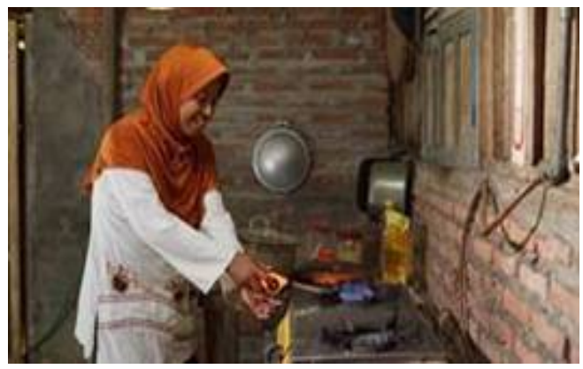
ExxonMobil supports programs to help women fulfill their economic potential and improve their well-being.

In 2018, contributions totaling $6.2 million were made to help advance economic opportunities for women. Empowering women is a key element in enhancing local and international economic development. Investing in women helps support broad transformation in developing regions and contributes to a more equitable society. For example, it helps to lower infant mortality, improve health and nutrition, increase educational opportunities, enhance economic growth and food security, and reduce poverty.